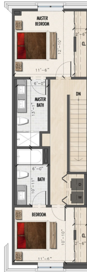
Third Level Plan