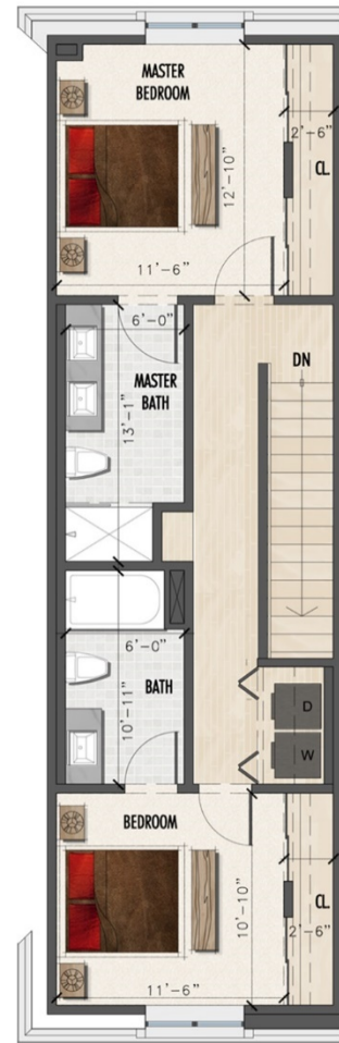
Third Level Plan