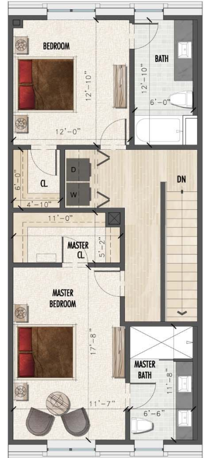
Third Level Plan